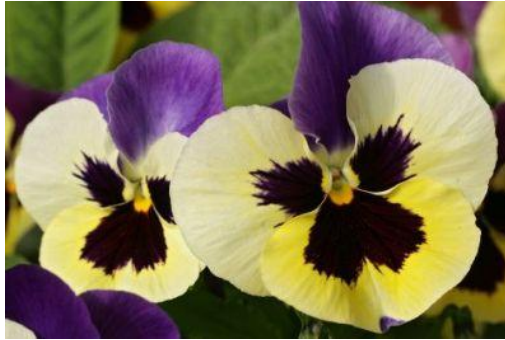
Fig 1: Viola wittrockiana